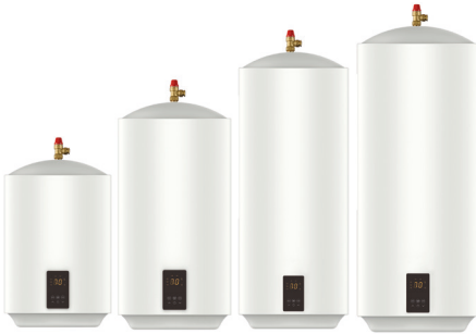
Wall mounted, connections at base