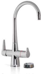
Crossover Valve alongside Zen Life Tap